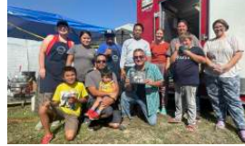
FOOD TRAILER ACTIVITIES WITH A SURPRISE