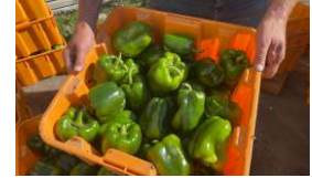
NORTHERN FOOD MINISTRY TIME FOR HARVEST