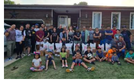
UKRAINIAN AND FILIPINO OUTREACH ONE BODY IN CHRIST